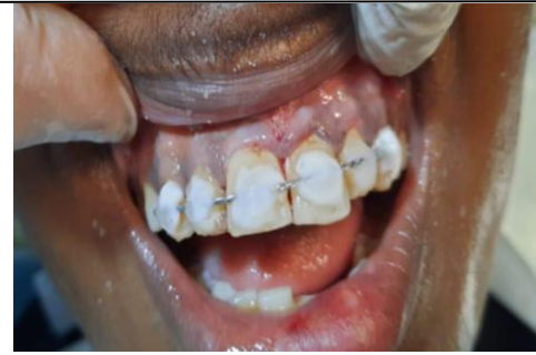
Figure 6: Composite splitting done and stabilized

Stabilization splinting was done using a stainless steel wire with Ivoclar composite resin extending from canine to canine 1,12 (Figure 6) Centric, eccentric premature contacts are checked with articulating paper and interferences relieved. Oral hygiene instructions were given and the patient was periodically reviewed.