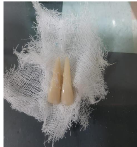
Figure 2: Avulsed 11 ,21