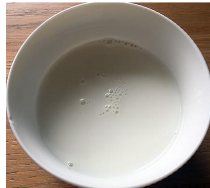
Figure 3: Bowl of milk as medium of transport