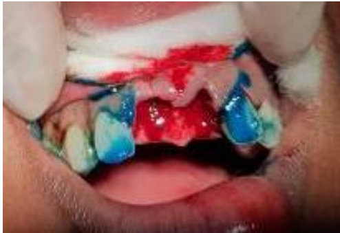
Figure 4: Debridement of the avulsed socket along with acid etching

The avulsed teeth were brought back within minutes and thorough debridement was done (Figure 4) by holding the crown part of the tooth with running saline. 9 After which the tooth was inserted in their respective socket to check for initial stability. The teeth were held in position by asking the patient to bite on a sterile gauze 10 (Figure 5) and digital palpitation was conducted on both labial and palatal surface to check the cortical plates were intact. Patient was asked to occlude in centric occlusion to check any pre matured contacts, selective grinding to be done if required.