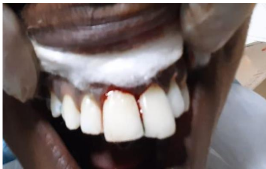
Figure 5: Avulsed 11,21 placed in their respective sockets to check snug fit

Stabilization splinting was done using a stainless steel wire with Ivoclar composite resin extending from canine to canine 1,12 (Figure 6) Centric, eccentric premature contacts are checked with articulating paper and interferences relieved. Oral hygiene instructions were given and the patient was periodically reviewed.